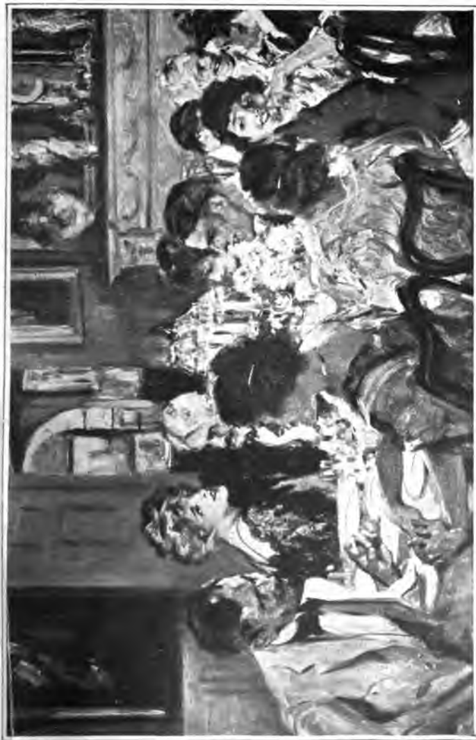
“She met Stephen’s smiling greeting with dignity, and only the quick flicker of a smile.”